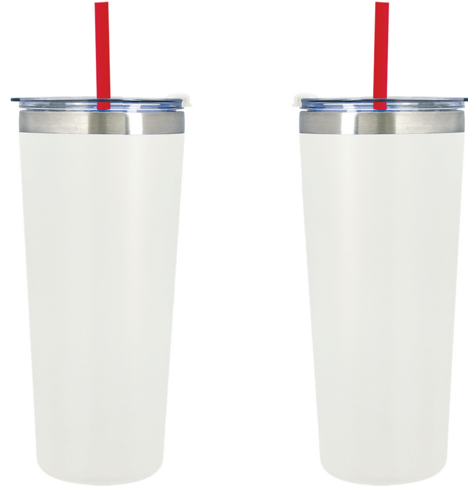
COMPOSITE NOT ACTUAL SIZE