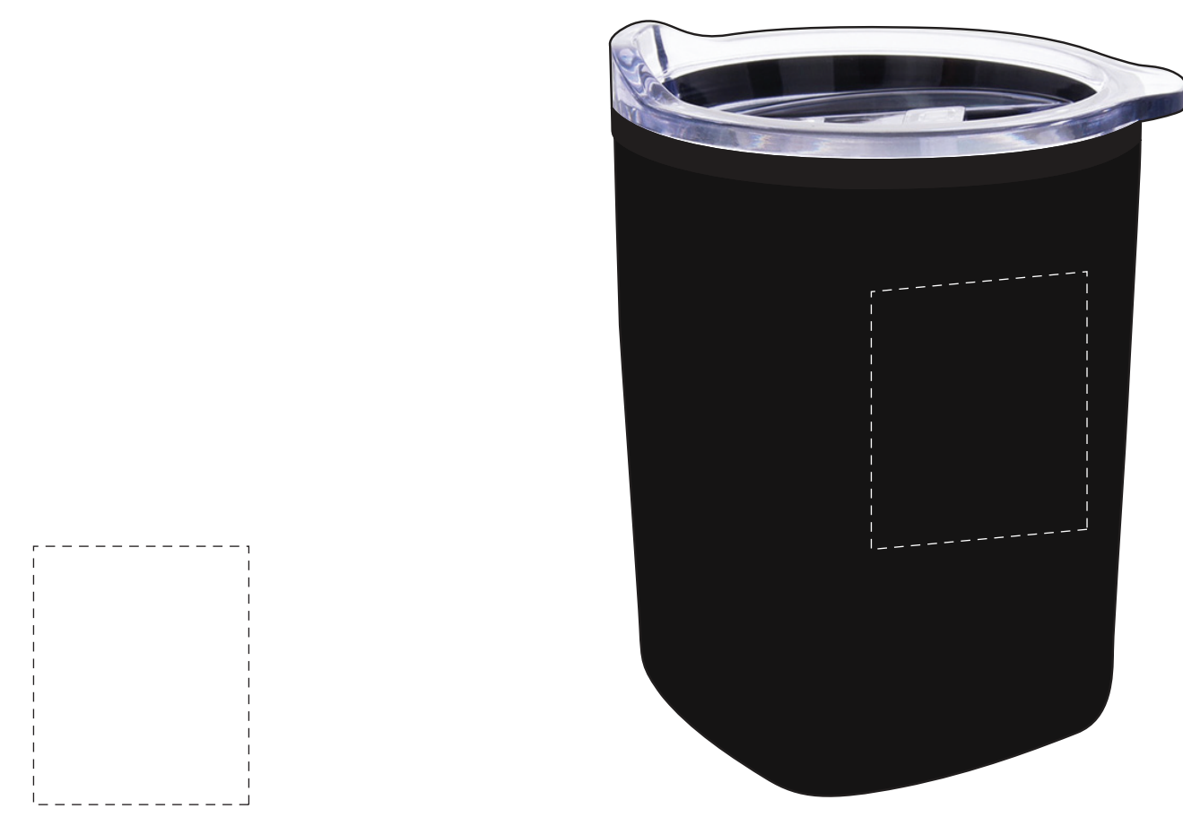
Imprint Size: 1 1/4" W x 1 1/2" H