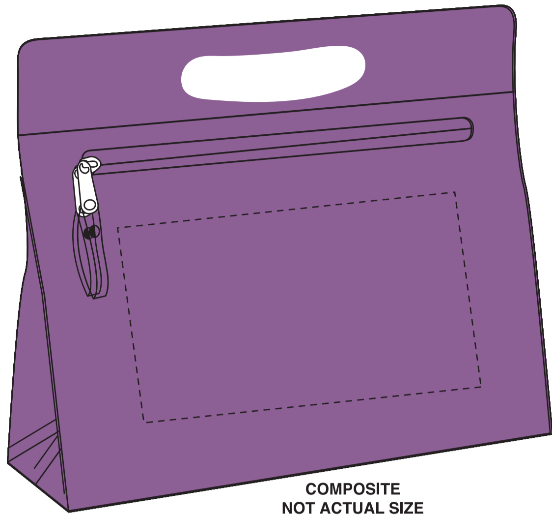
COMPOSITE NOT ACTUAL SIZE