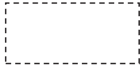
Standard Horizontal imprint