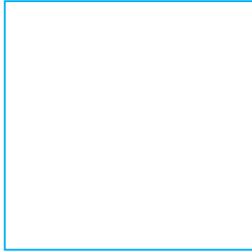
Antibacterial Hand Sanitizer 2 fl. oz.