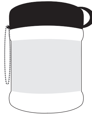
Cap Color Options

Red line represents bleed line Dotted line represents the label / cut line Blue line represents print area