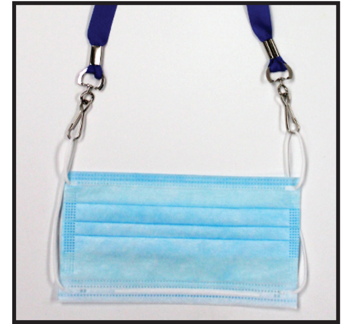
Mask Not Included