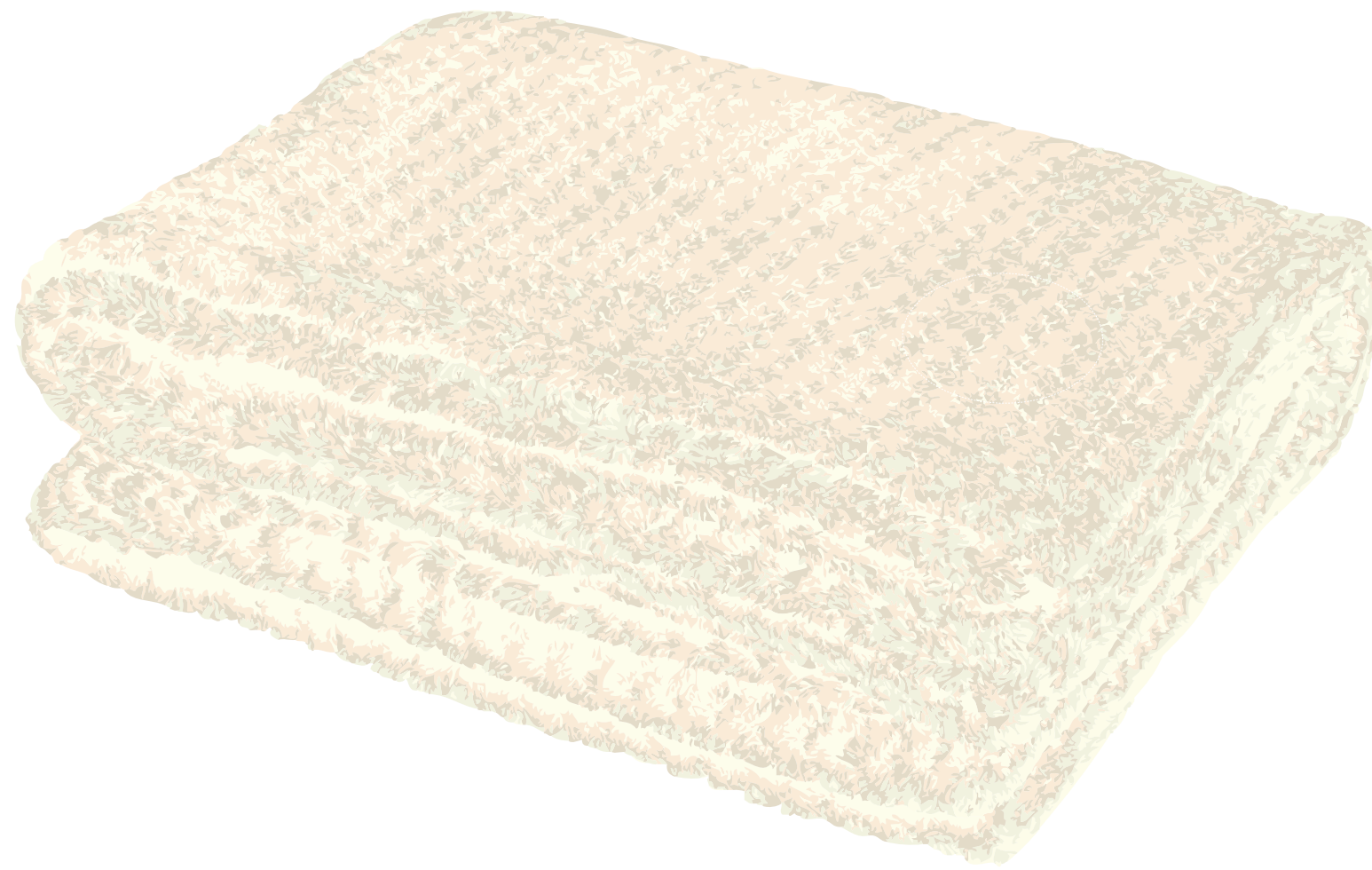
COMPOSITE NOT ACTUAL SIZE