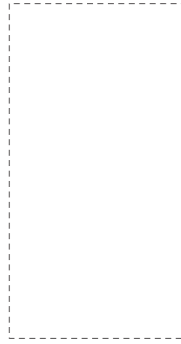
MAX Imprint Size: 1.8" W x 3.5" H