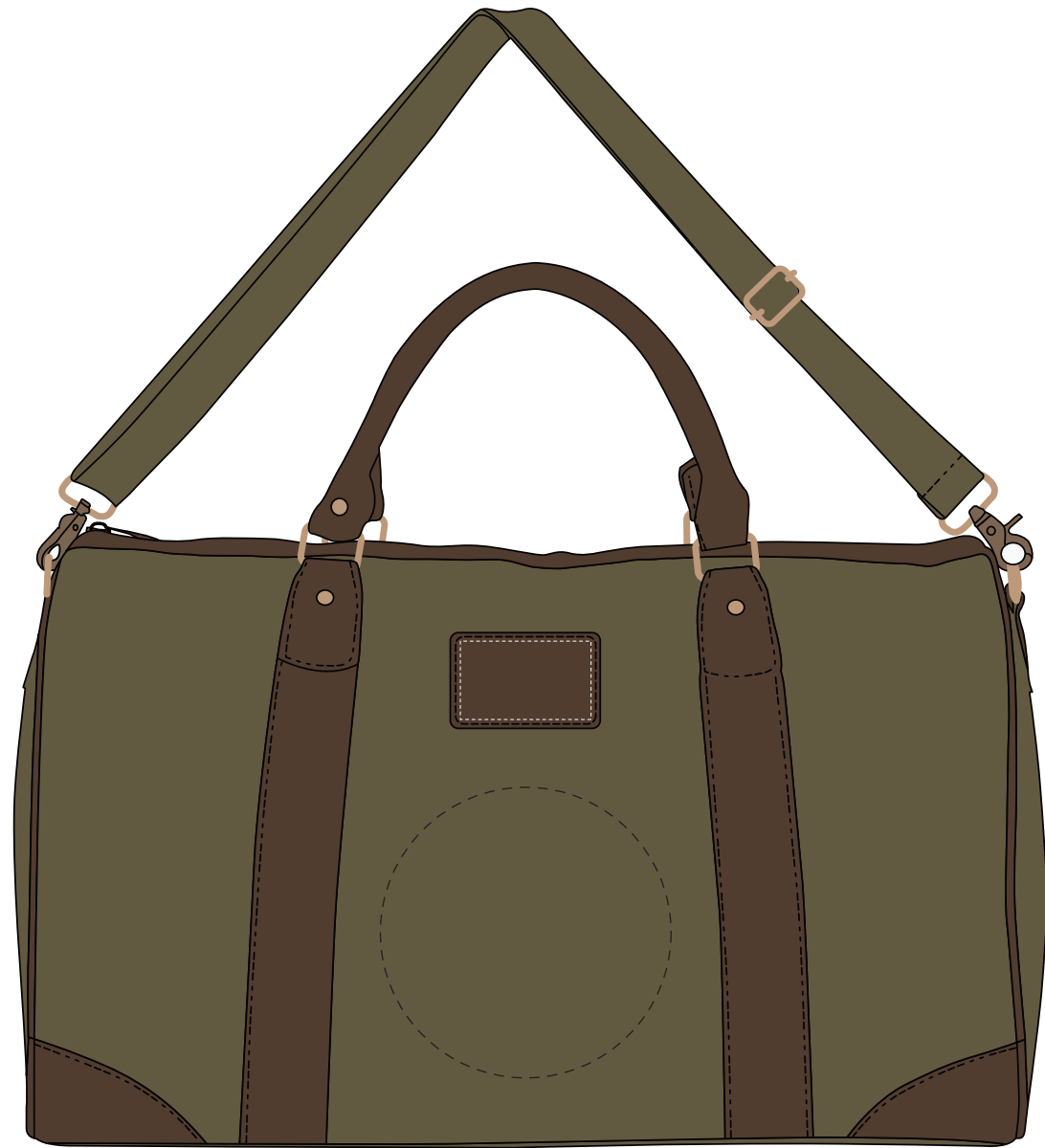
COMPOSITE NOT ACTUAL SIZE