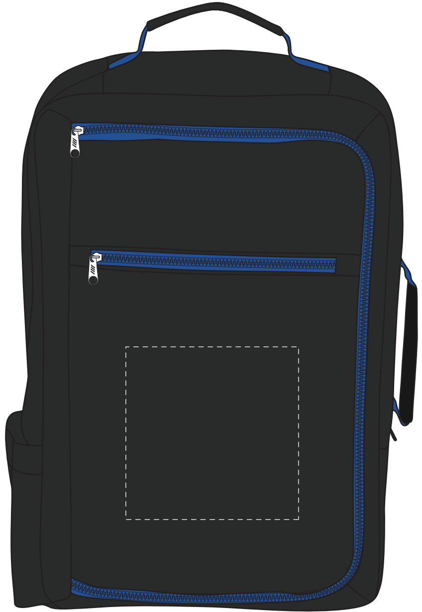
COMPOSITE NOT ACTUAL SIZE