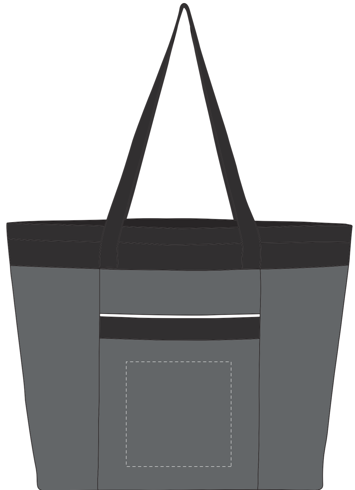
COMPOSITE NOT ACTUAL SIZE