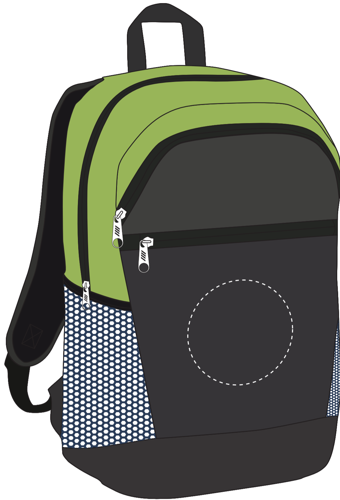
COMPOSITE NOT ACTUAL SIZE