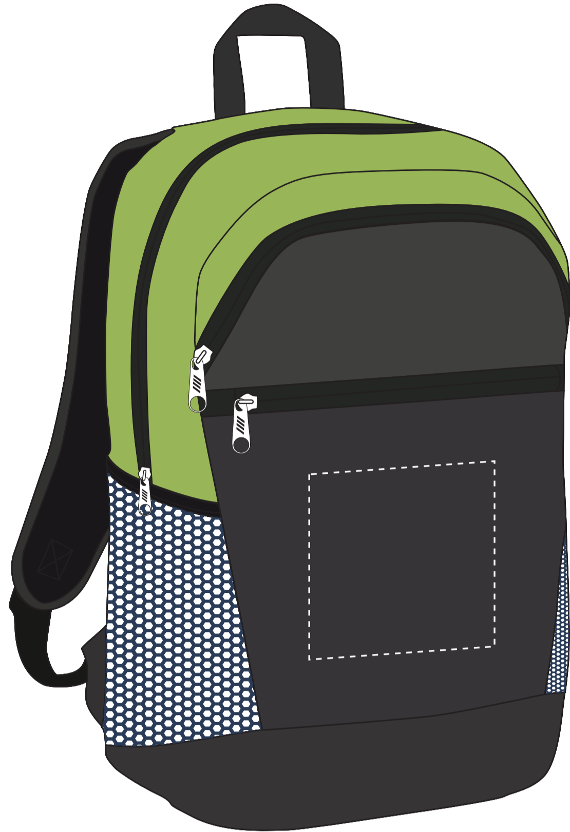
COMPOSITE NOT ACTUAL SIZE