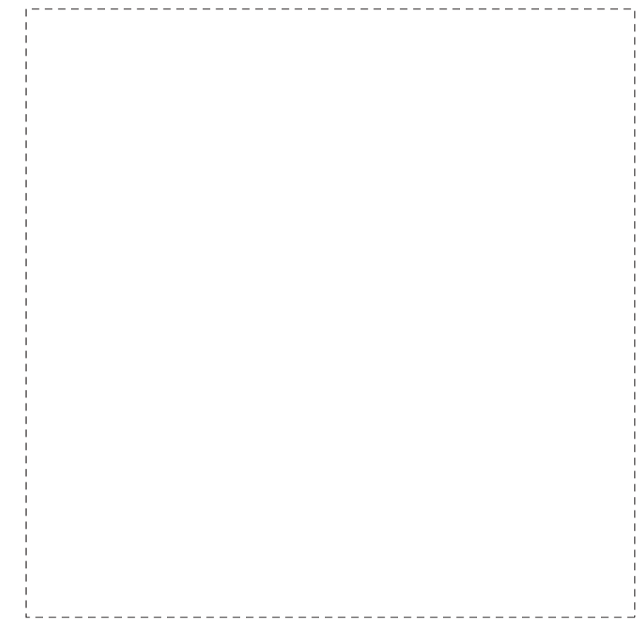
Imprint Size : 4.5" W x 4.5" H