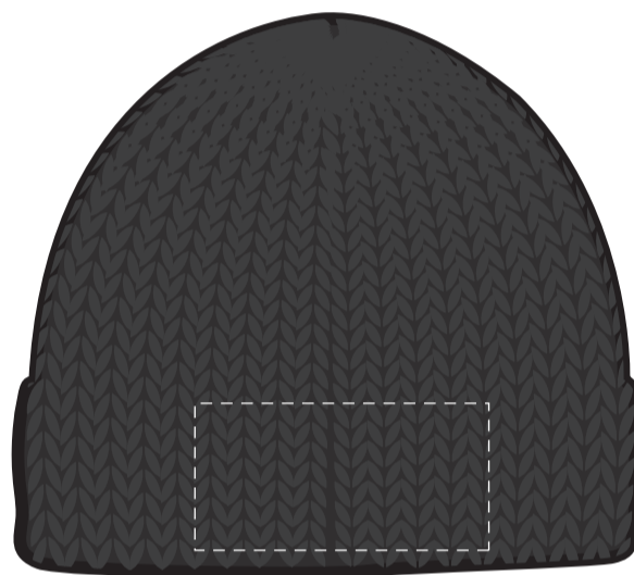
COMPOSITE NOT ACTUAL SIZE