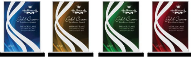
CATALOG SAMPLE ART